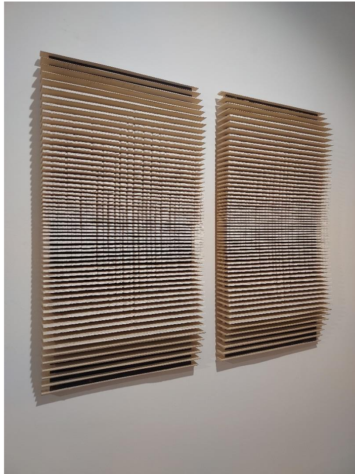
Flavio Senoner_line reliefs white 182-183_2020_burned and painted limewood_101x53x10 cm