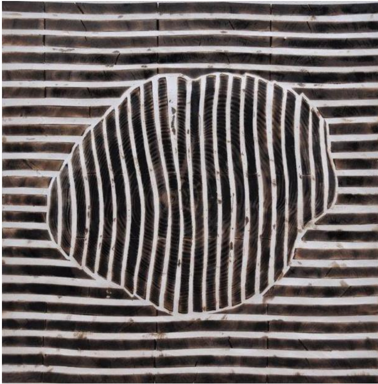
Flavio Senoner_ Untitled 56_2016_burned wood and plaster_70x70x7 cm