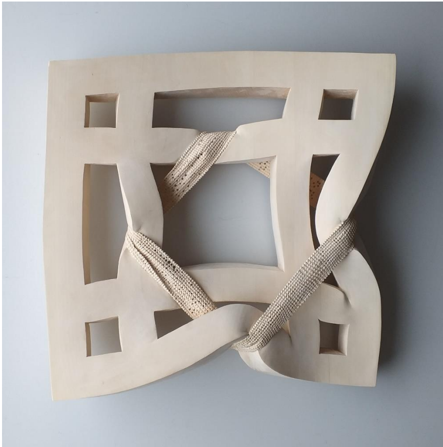
Egon Digon_Barocke Geometrie_carved limewood_50x50 cm_ 2020