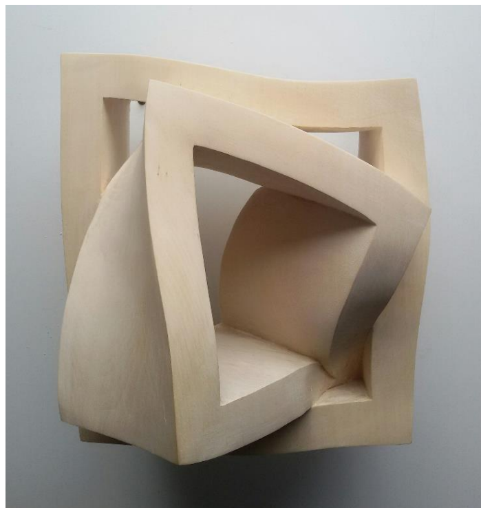
Egon Digon_Birth_carved limewood_30 x 30 cm_2018