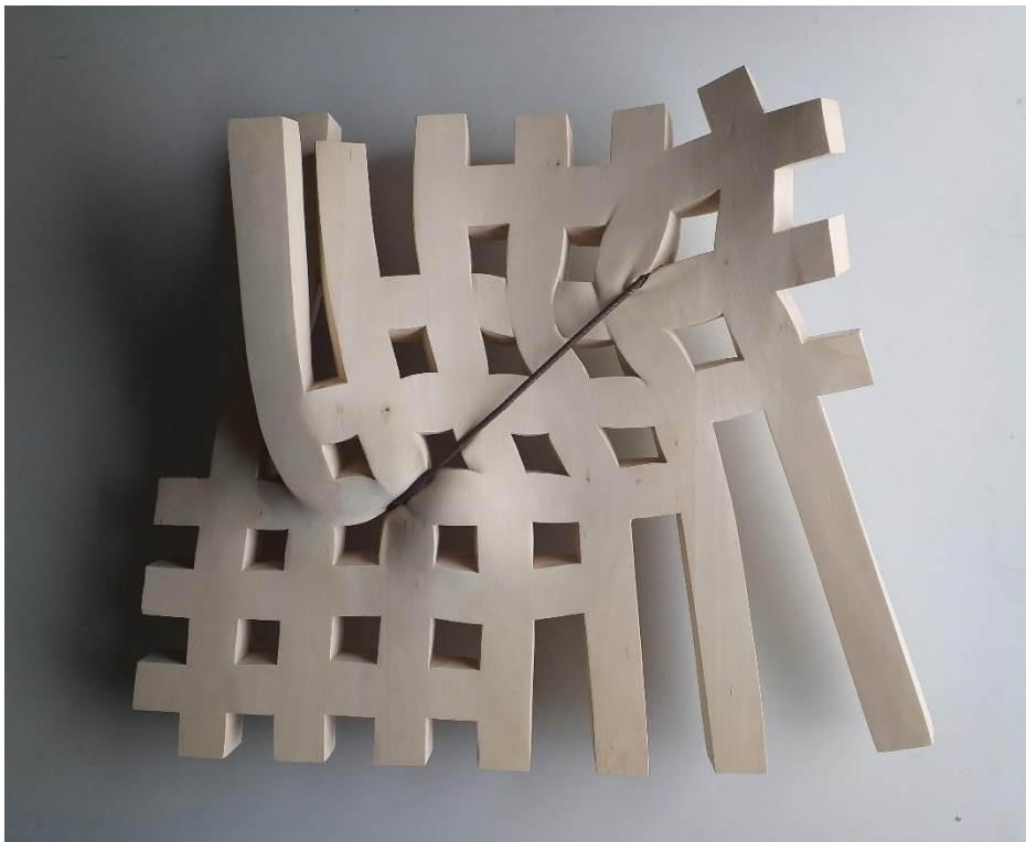
Egon Digon_mit Widerstand aufsteigen_carved limewood_75 x 65 cm_2019