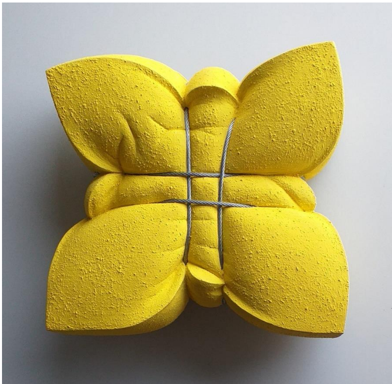
Egon Digon_Quadratische Sonne_32x33 cm_carved and painted limewood_2022

Egon Digon creates seemingly soft sculptures from wood. Central to his work is a belief in the transformative possibilities of the hard material given by wood and at the same time a deformation of its standard geometry and form. In this way Digon challenges viewers with the surprise of the material through the forms present with exciting sculptures, with formal aesthetic qualities.