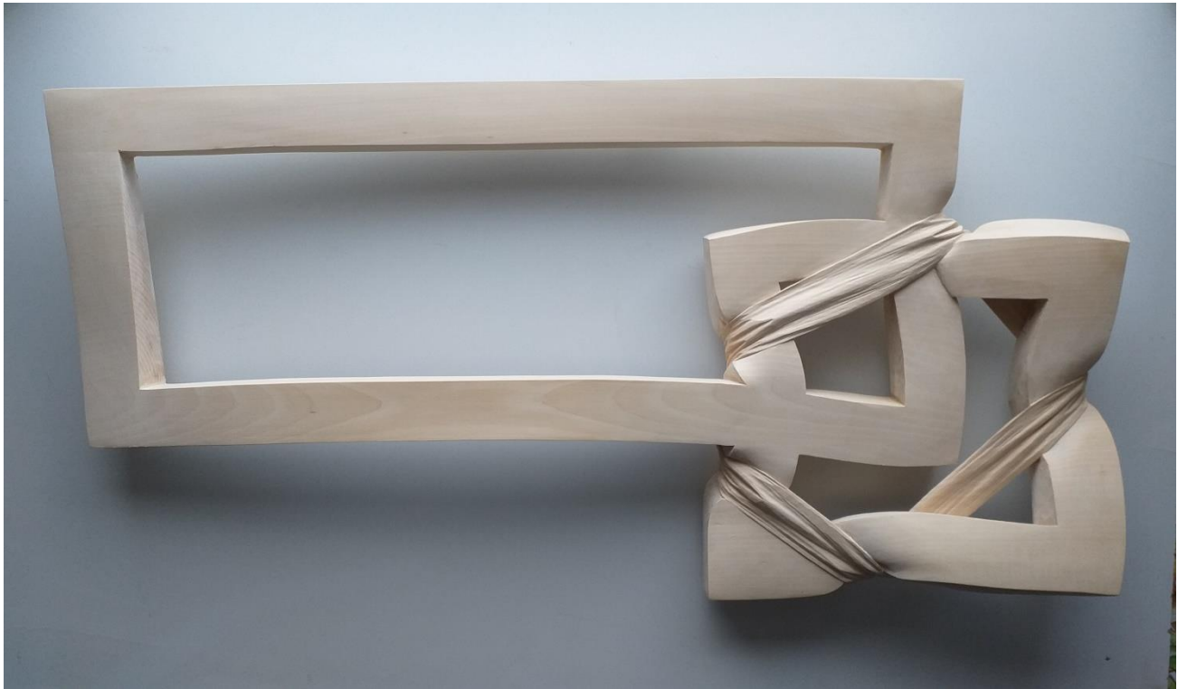
Egon Digon_Circled empty_carved limewood_ 110 x 55 cm_2019