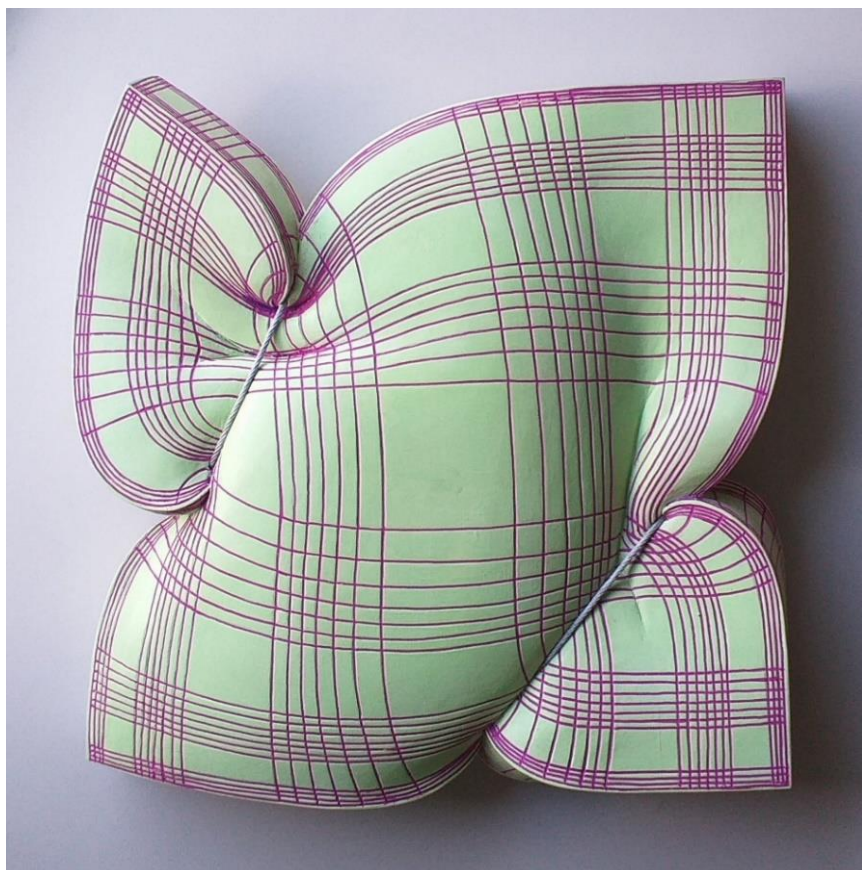
Egon Digon_Reduction_carved and painted limewood_50x50 cm_2022