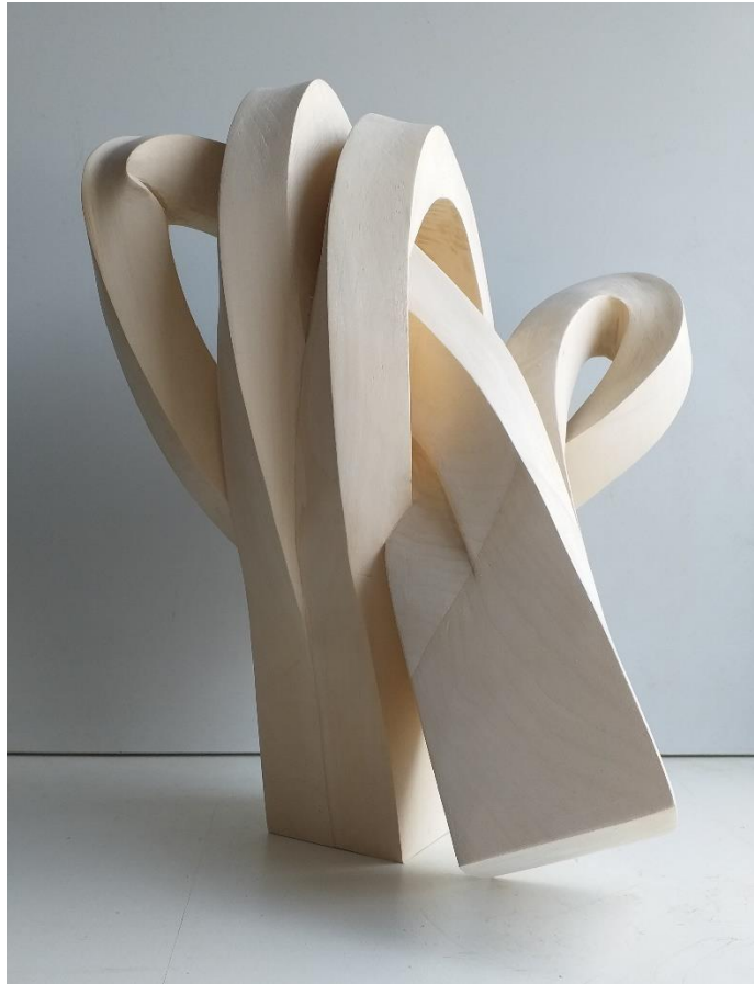
Egon Digon_Comeback _carved limewood_38x37x24cm_2021