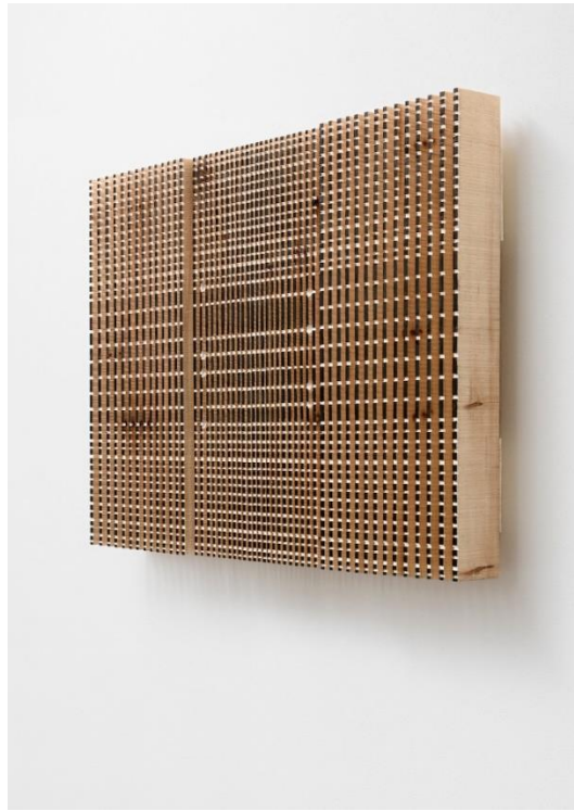
Flavio Senoner_Line Relief 89_2017_burned wood – painted wood_96x70x13cm