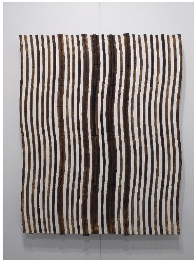
Flavio Senoner_Untitled154_2020_plaster and burned pinewood_107x85x6 cm