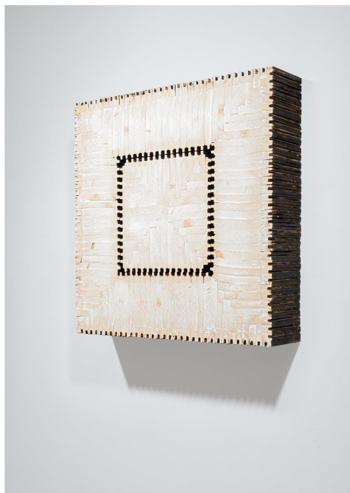
Flavio Senoner, untitled 152, 2020, burned and painted pinewood, 67x66,5x14,2cm sideview