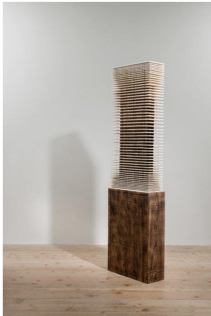
Flavio Senoner_line sculpture 144_2020_burned and painted wood_112x50x17 cm + base 78 cm