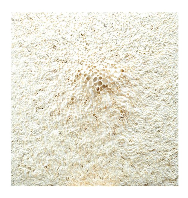
Raindrop prelude / 111 \times 111 cm / Hanji (Traditional Korean Paper) / Personal Technique