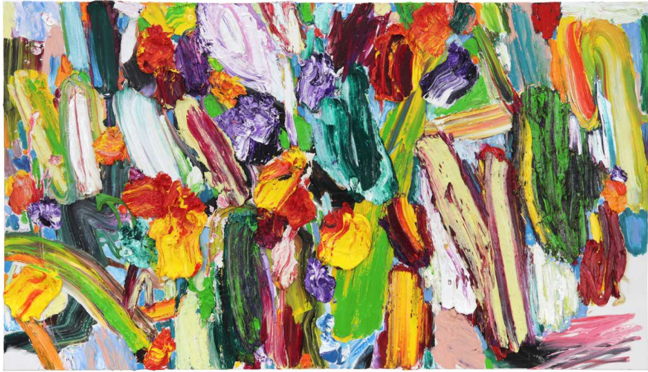
Lay Out (352), Öl auf Leinwand, 120 x 210 x 7 cm, 2017/18/23