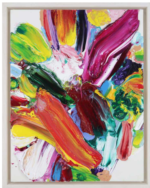
Lay Out (531) Öl auf Holz 60 x 42 x 4 cm m.R. 64 x 47 x 5 cm 2023