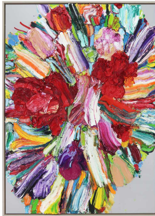
Pour Out (25), Öl und Lack auf Holz, 172 x 127 x 6 cm, 2016/23