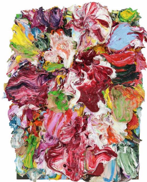
Splash Out (44) Öl und Ateliermaterial auf Holz 65 x 49 x 10 cm 2010/22/23