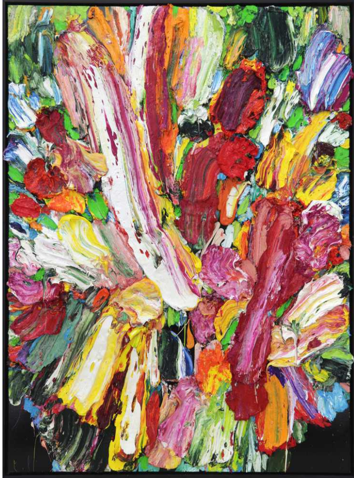
Lay Out (188) Öl auf Holz 173 x 129 x 8 cm 2013/22/23

Gallery artpark, Moon Park Hanasastr. 19-21, 76189 Karlsruhe, Germany www.artpark.eu | gallery@artpark.eu Mobil Nr. 0160-8740677