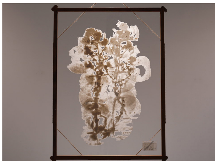
Flora of Formosa: Twins This work is the result of three years of collaboration with the Taiwan Forestry Research Institute. Combining printmaking with handmade paper and the watermark technique, creates an inkless, subtle, and elegant contemporary print art.