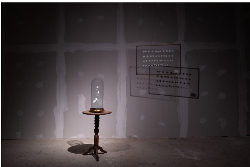
View of the exhibition "Flora of Formosa: Solo exhibition of Yang Chung Ming"