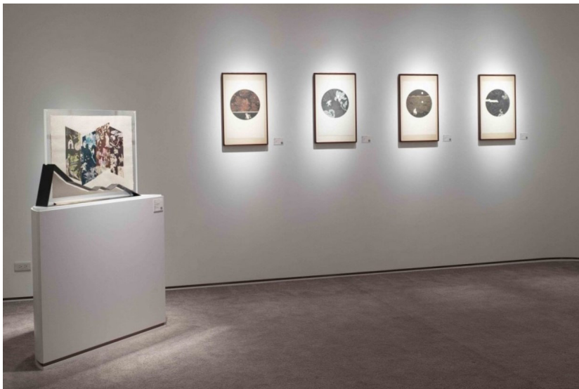
View of the exhibition "Between the Trails to the Oriental Dream: ZAO Wou-Ki and YANG Chung-Ming Dual Exhibition"